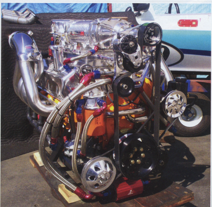
PFAFF: Paul Pfaff Enterprises will display this 900-hp engine with upgraded Whipple supercharger, capable of 1025 ponies.