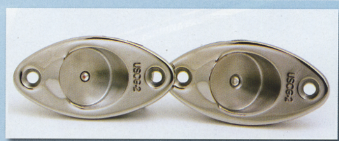
LIVORSI: Livorsi of Grayslake, IL, will show off these stylish LED Elliptical Navigation lights, now made of 316 marine grade stainless steel with a polished finish, in both L.A. and Miami.