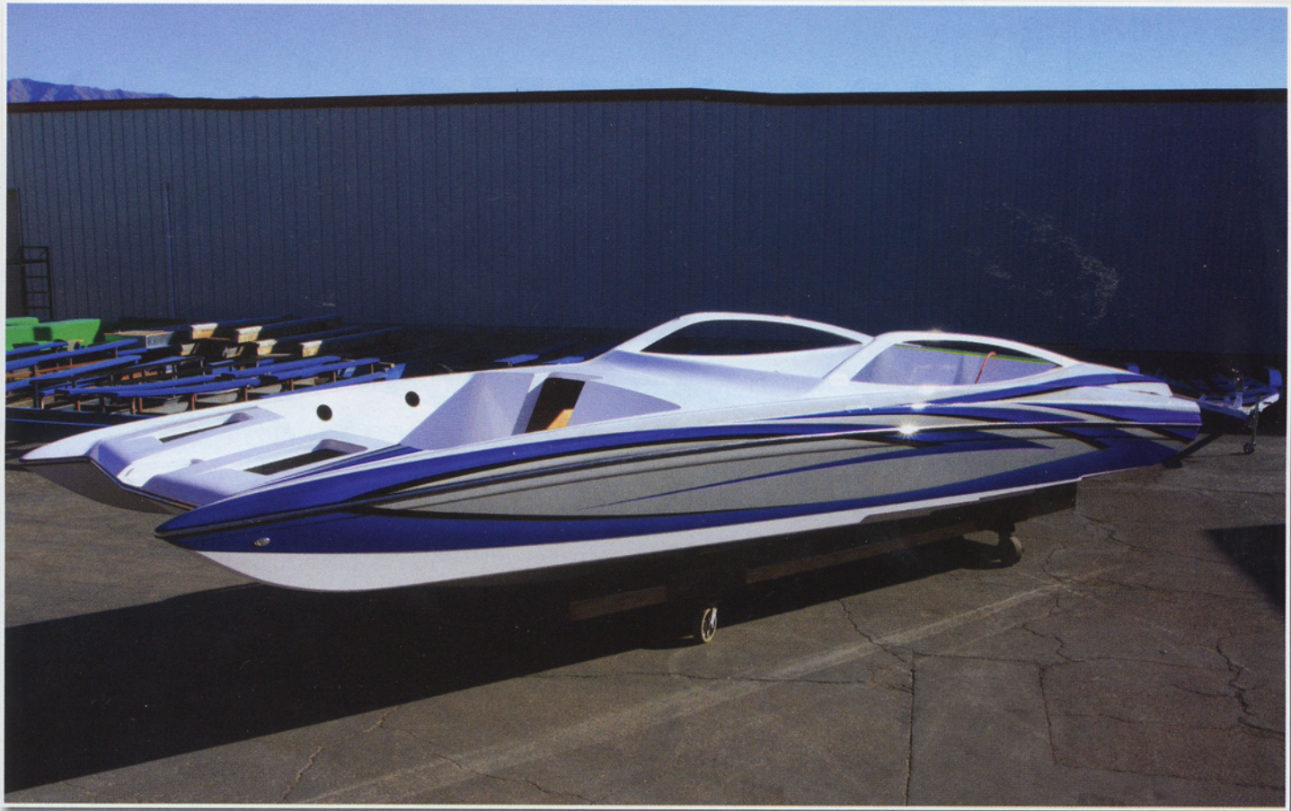
ADVANTAGE: The Lake Havasu City builder of the 27' and 29' X-Flight models will go for the trifecta when it unveils the new 34-foot version of the unique craft, which is a performance deckboat that looks like a catamaran but is actually a vee bottom.